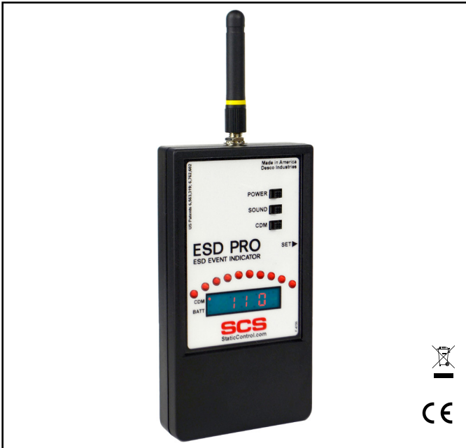
Figure 1. CTM082 ESD Pro ESD Event Indicator.